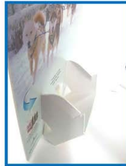
3. Fold up & Insert into Slits