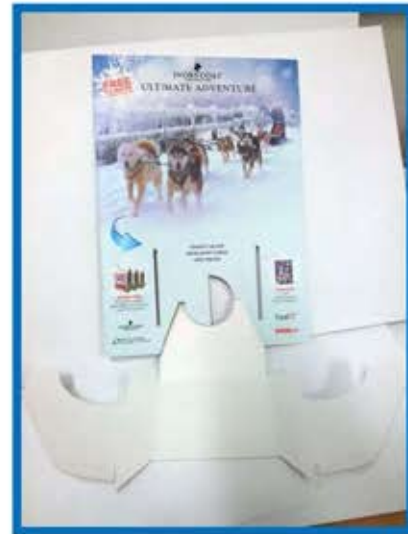
2. Twist bottom to the right