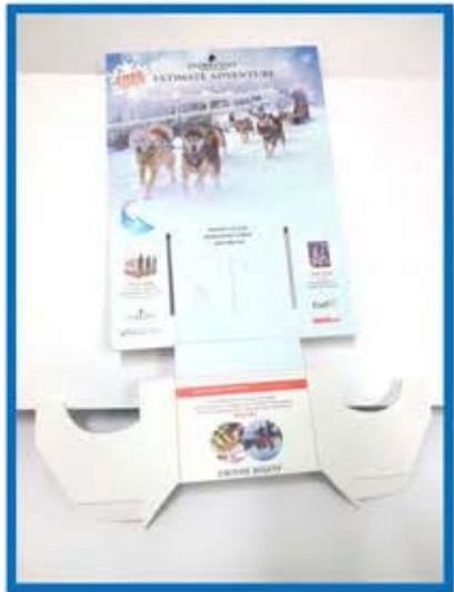
1. Received Flat